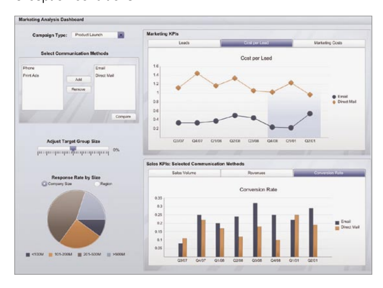
Figure 1: Use Visual Models and Dashboards for Insight into Issues and Opportunities

It has often been said, "If you can't measure it, you can't manage it." Scorecards and other performance management tools enable executives to establish business metrics for their teams, update and monitor results, and communicate results as appropriate so that minor problems can be identified early-on and corrective action quickly taken.